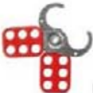
Master Lock Lockout Hasp with Vinyl Coated Handle, 1" Inside Jaw Diameter

My Locking box, one of my congregants made two of these this for me!